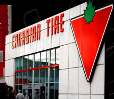
Exterior Wall Panels

Fiber Reinforced Plastic (FRP) is the most designer-friendly exterior facade material, providing unlimited shaping possibilities, consolidation of multiple parts, and significant cost reductions for installation and long term maintenance.