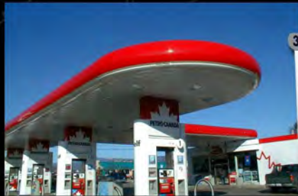
Canopies and Fascia

FormaShape produces SilkTek Curved Composite Cladding and canopy products for new and re-imaged retail facilities. We specialize in multi-site projects and challenging designs with strict compliance to brand image and colors.