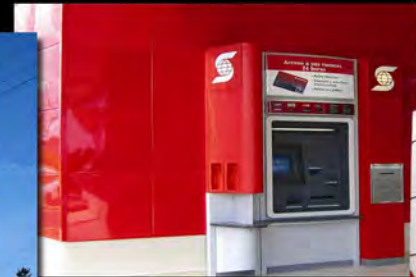
ATM Kiosk Cladding